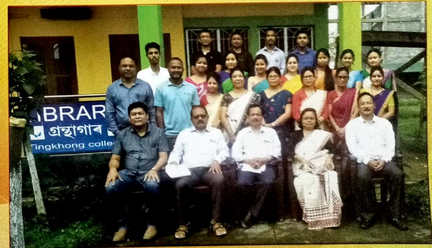
Principal, Vice-Principal and Faculty Members