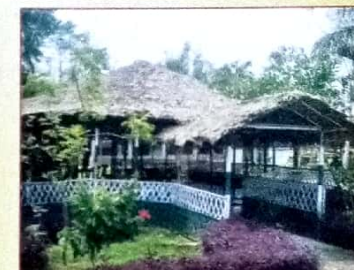
Eco-friendly College Canteen

Failure to return the book within the period the student will have to pay a fine of Rs. 1.50 per day for 15 days and of Rs.5.00 per day thereafter. However on request, the librarian at his/her discretion may renew the issue of a book. But the book must be returned within one month from the date of its first issue.