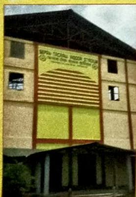
Sepak-Tacraw Indoor Stadium