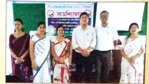
Workshop (Dept. of Assamese)