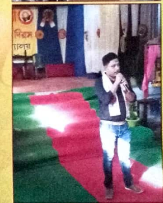
Circle Officer, Tingkhong Revenue Circle is addressing the students on the occasion of 46th Foundation Day of Tingkhong College