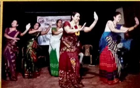
Workshop (Dance & Music)