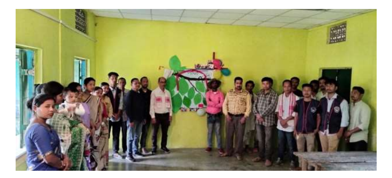
Inauguration of wall magazine of the special camp.