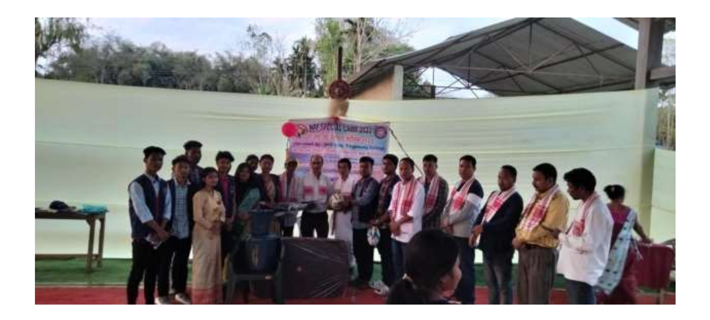
Tingkhong College NSS Unit donating furniture and sports material to Na-Sripuria M.E School.