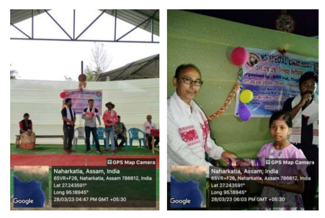
Speech by local community members.